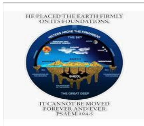
Figure 2 - Heaven and earth in antiquity

How do we then understand the firmament? Only God can truly answer that, however, I believe that the firmament described in Genesis 1:6-18 is merely expanding Genesis 1:1 into more detail, but from mankind's vantage point as we look up into the sky (physical heaven or Universe). God does not describe the Universe in precise detail due to its vastness and complexity as I do not believe it was necessary for God's followers to lose themselves in the precision of scientific data, besides, the cosmology in antiquity was pretty basic. Without the advantage of telescopes and spaceships, the image they compiled by merely using the scriptures and observation of the sky is pretty accurate, but of course, they missed Job 26:7 that says the earth hangs on nothing, and they misunderstood that the sun revolves around the earth instead of the other way round, see Joshua 10:12-14 where the sun stood still, i.e. they did not understand that it was the earth that stood still because from their vantage point, the sun appeared to be moving, hence, why Figure 2 is what they came up with.